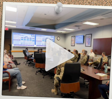
A-Staff Information Session Video